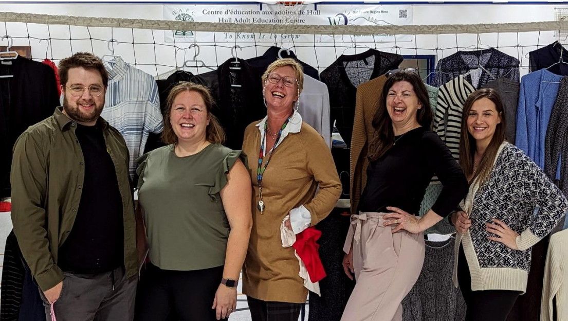
The Hull Adult Education Centre Annual Freecycle event.