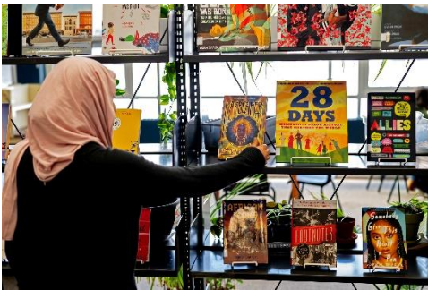
The Library Team’s Black History Month book resources

Whether you're seeking enlightening accounts of historical events or vibrant celebrations of Black heritage, the library team’s diverse selection offers something for every reader.