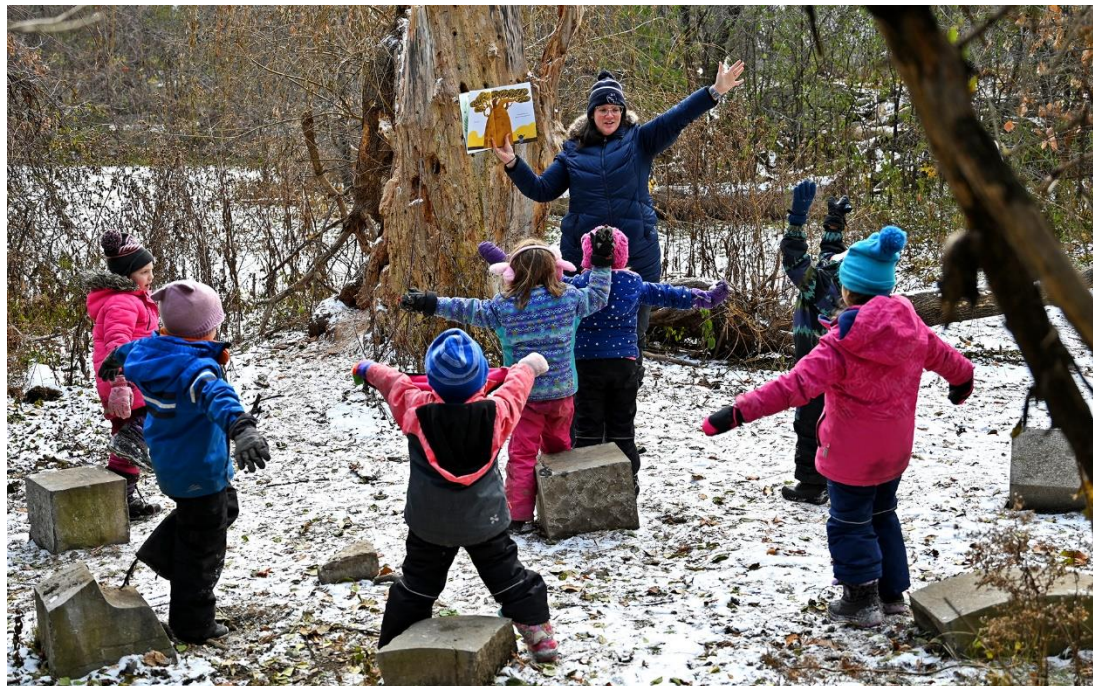
Nature immersion-kindergarten program at PETES.

Please join me in reading about and celebrating the efforts and accomplishments of those who make up the WQSB! g