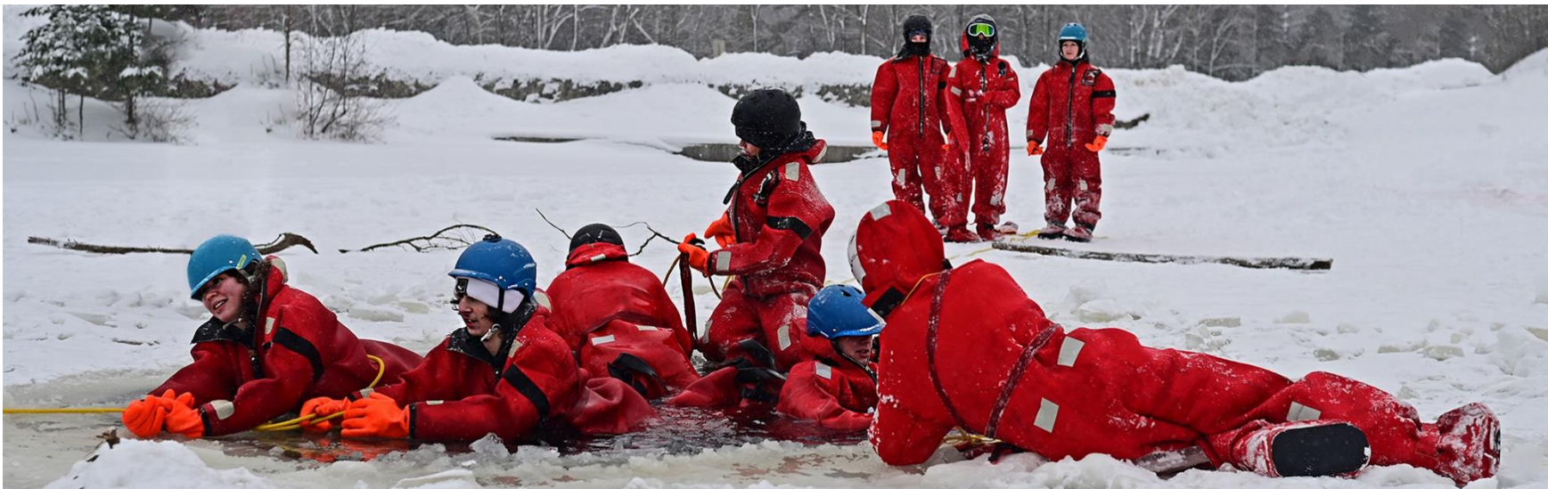
Ice survival certification with Boreal River Rescue at St. Michael’s High School.

Link to Career page: https://westernquebec.ca/resources/careers/