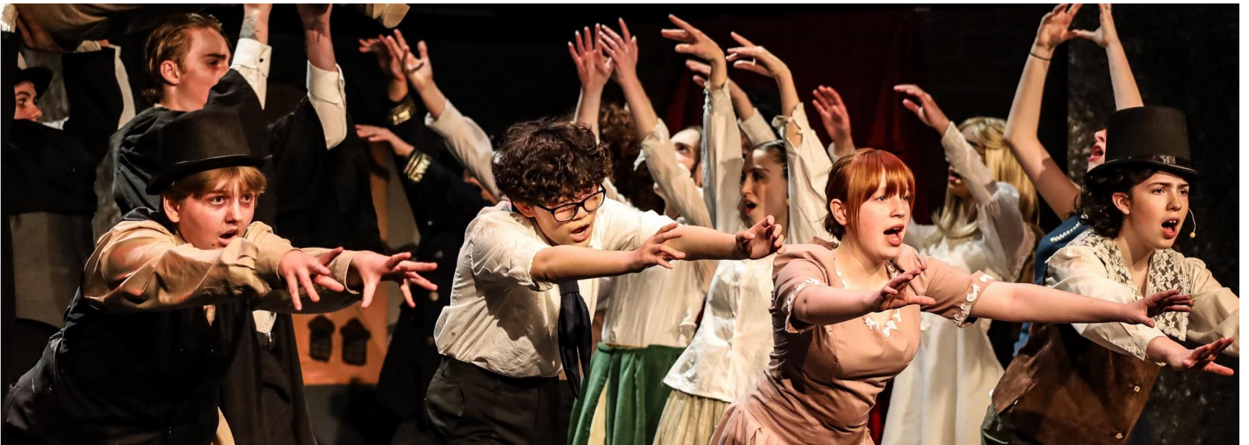
of the performance of Sweeney Todd at Hadley Jr./Philemon Wright High School