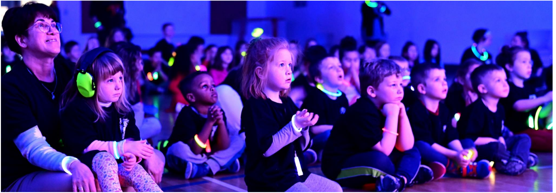
at Buckingham Elementary School