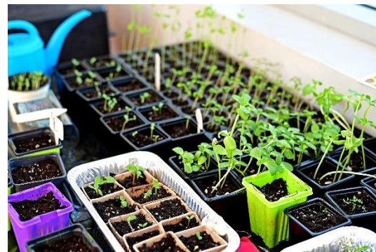
WQCC's School Garden Project.

Spring has arrived, bringing with it the warmth and excitement of gardening season.