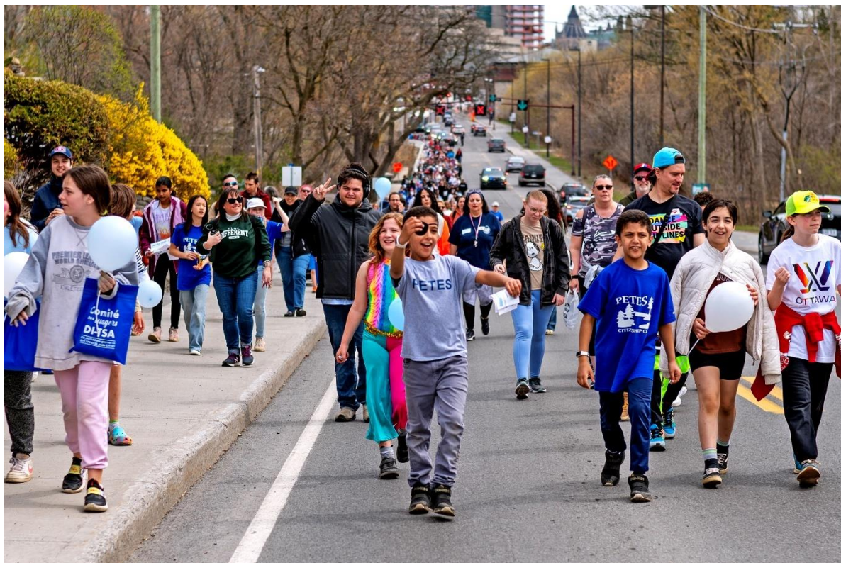
PETES Autism Walk in partnership with Trait d'Union Outaouais Inc.

I would like to thank the communications department and their contributing writers for their work on this edition of the Gazette. Happy reading. Take good care, g