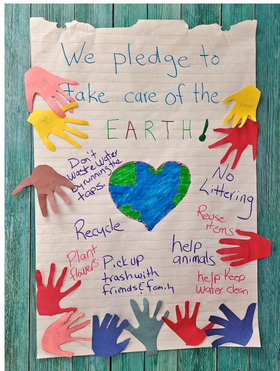
Earth Day activities at G. Theberge

At G. Theberge, teachers integrate Earth Day activities into the curriculum year-round, addressing aspects of global warming and environmental issues.