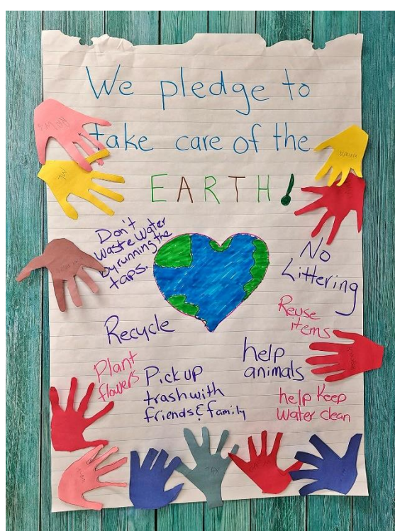
Earth Day Every Day on PG. 6.

This year's Autism Walk was a hit, with several hundred people taking part! Full Story