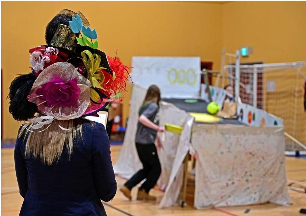
Destination Imagination hosted by Symmes Junior High/D'Arcy McGee High School on March 22 nd