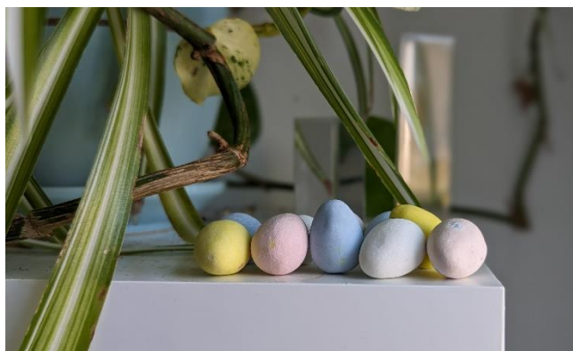
Happy Easter! Easter long weekend is March 29 to April 1.