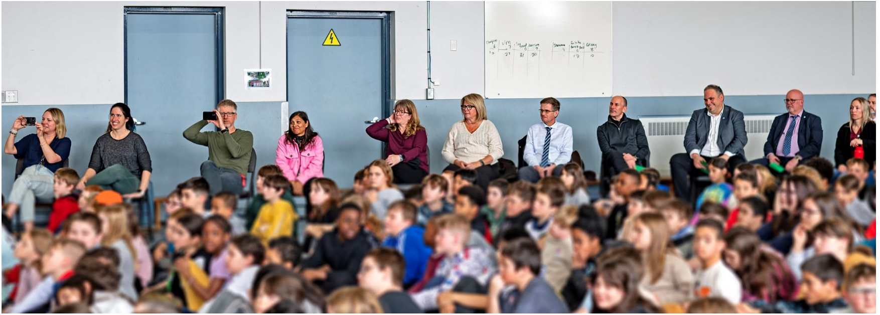
WQSB Senior Administration and GG Staff at Greater Gatineau Elementary School Performance