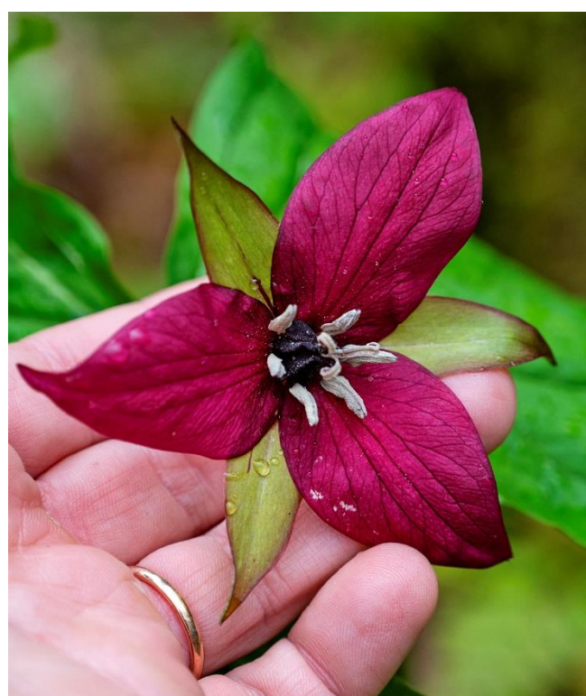
Red Trillium, Maniwaki Woodland Camping Trip PG. 3.