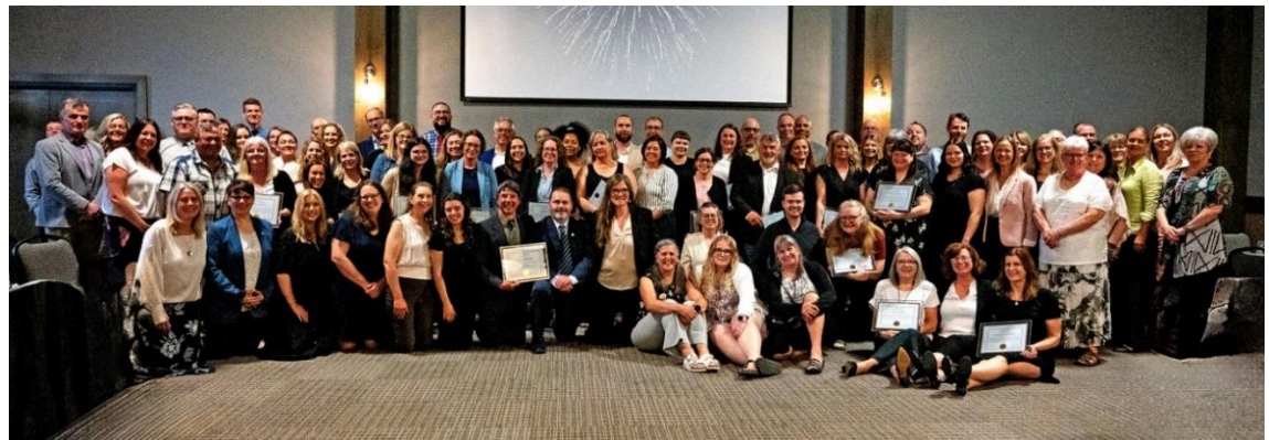
The Western Québec School Board's evening gala celebrating exceptional staff members, held on Tuesday, May 14 th at the beautiful Gatineau Golf Club in Aylmer.

Enjoy this latest edition of the WQSB Gazette from our Communications team and ever-growing list of contributors. Take good care, g