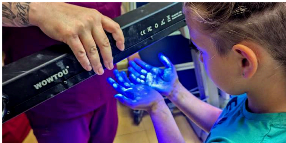
Fluorescent light demo reveals fake germs