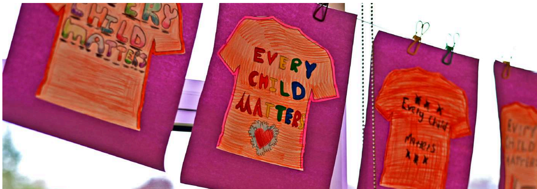
Every Child Matters student-made art at Greater Gatineau Elementary School