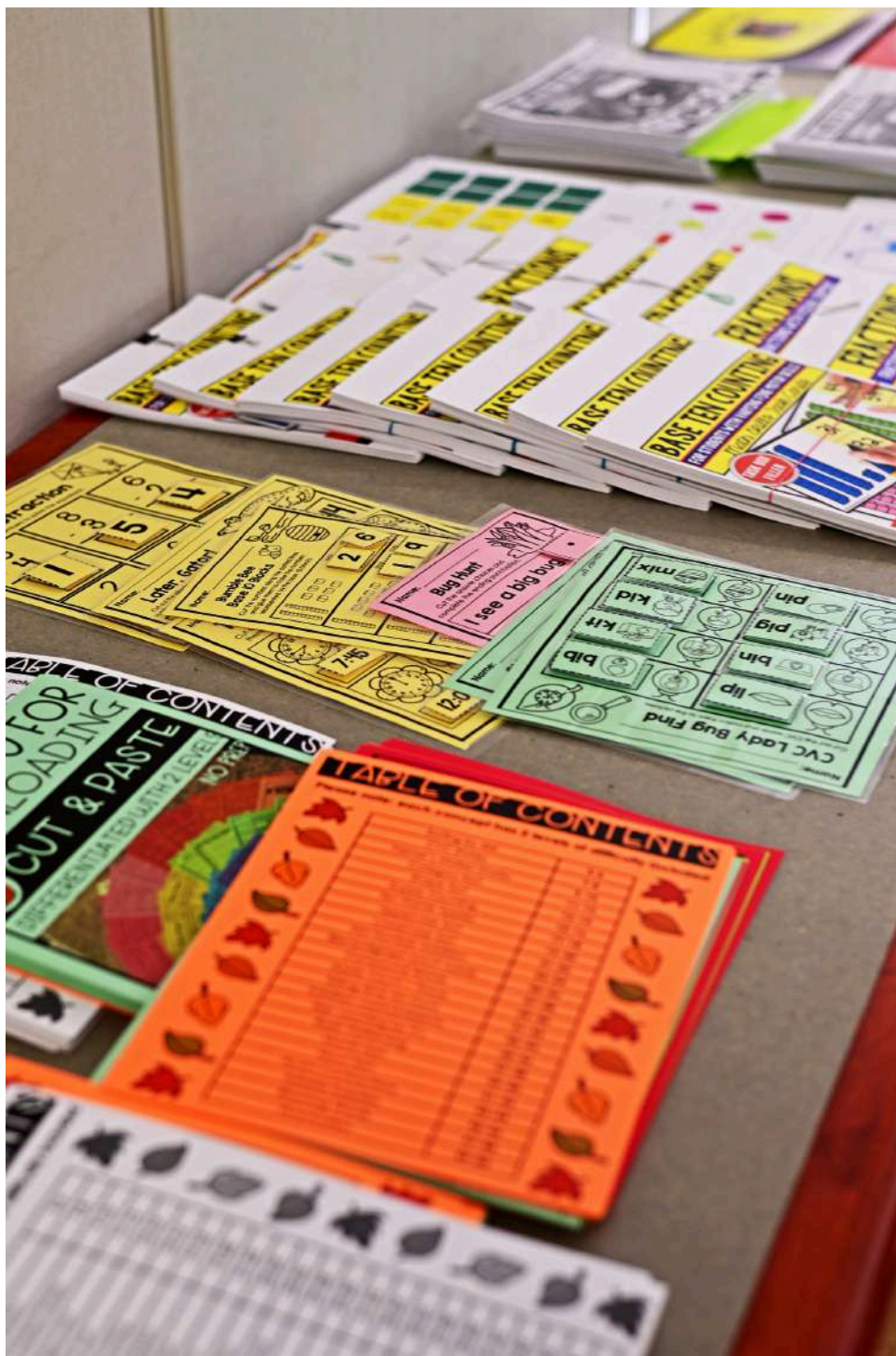
Table full of resources for all levels of learning