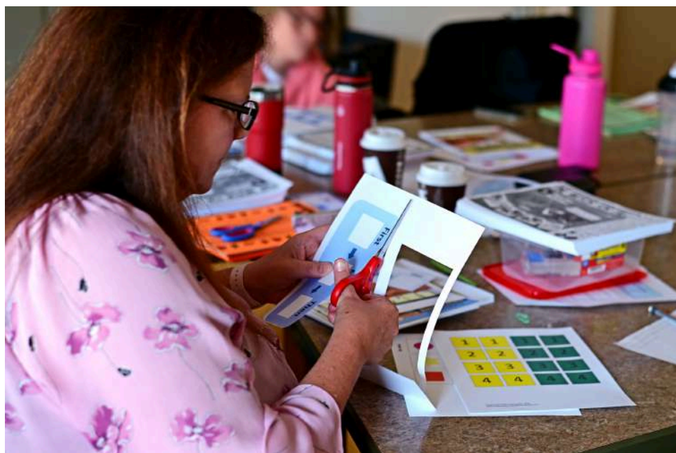
Special Education Technicians create resources after the presentation