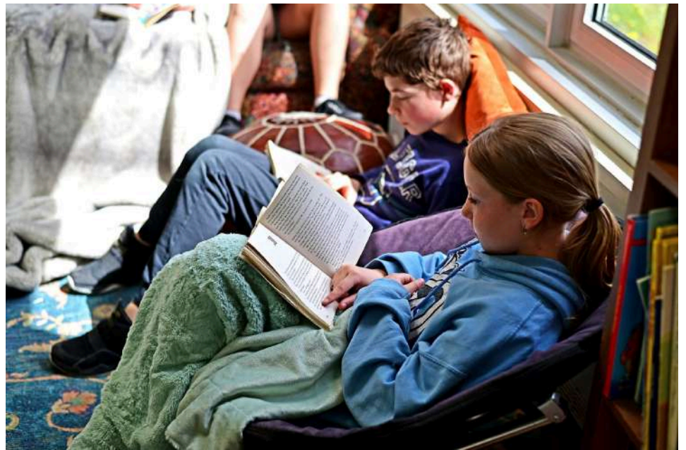
Students reading at Namur Intermediate School