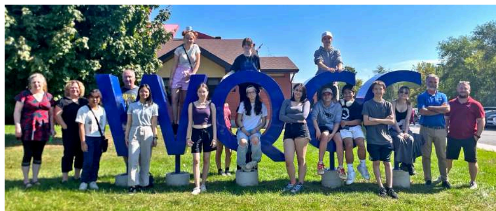
Group photo taken with the student-made WQCC letters outside the centre

Noranda's Secondary 3, 4 and 5 students recently had a successful and action-packed visit to the Gatineau/Ottawa region. On their first day they visited the Museum of History, Parliament and CÉGEP Heritage College. On their second day they visited the Western Québec Career Centre, where they were given a tour of the building and introduced to all their programs. Noranda students also had time to shop as well as visit Funhaven in Ottawa. They returned home to Rouyn-Noranda both exhausted and fulfilled!