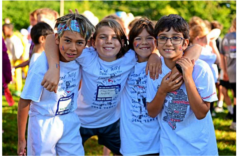
"I've been waiting for this all my life," exclaims one very excited birthday boy