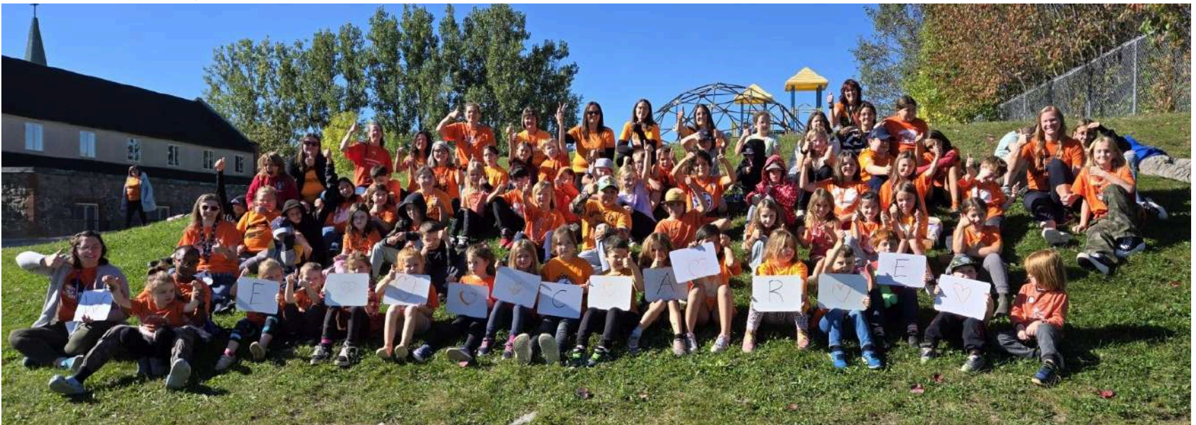
G. Théberge School