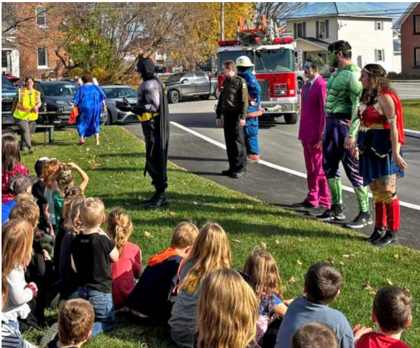
Super heroes and villains visit DRSEM