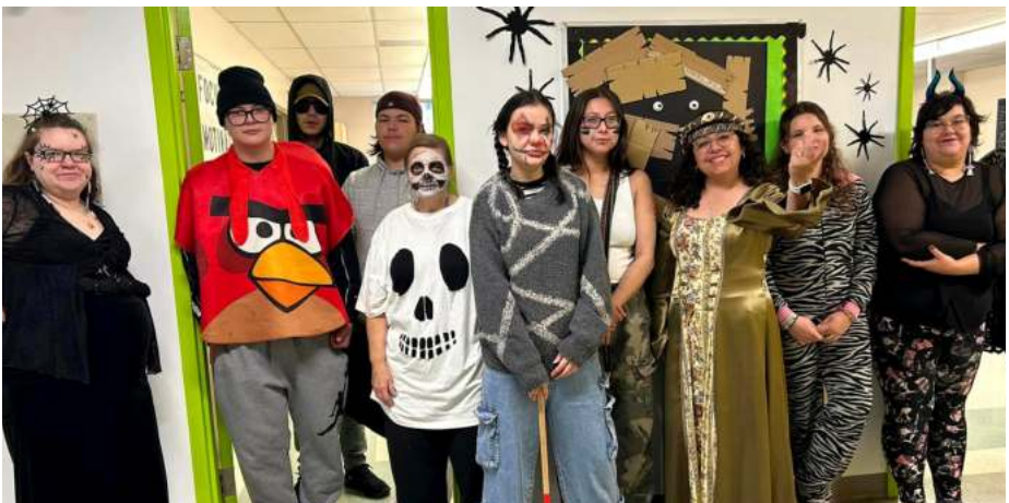
Val-d'Or Continuing Education Centre in the spirit