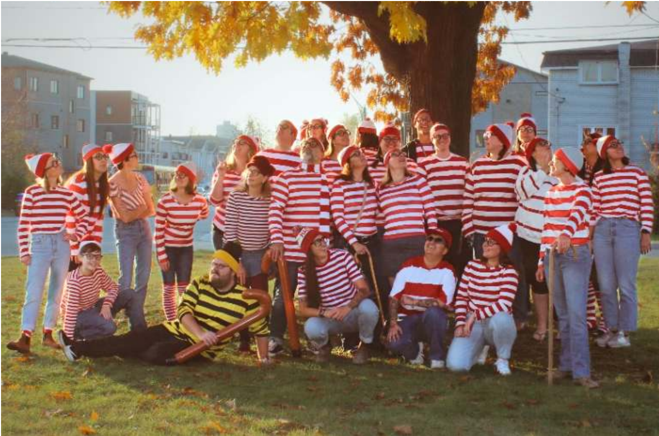
Hadley JR/PWHS found all the Waldos & Wilmas!