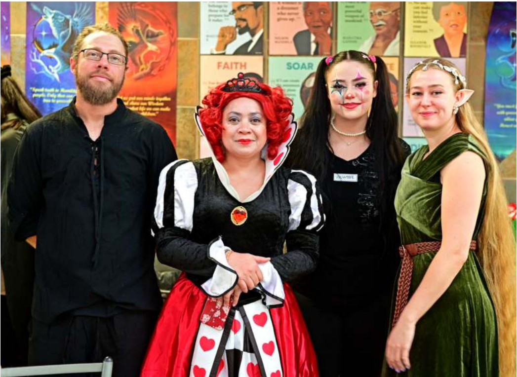
The WQCC did a cash prize raffle at lunch with delicious treats for sale and proved that you're never too old for Halloween