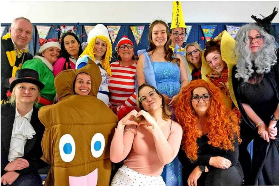
Staff & students went all out for Halloween at Noranda School