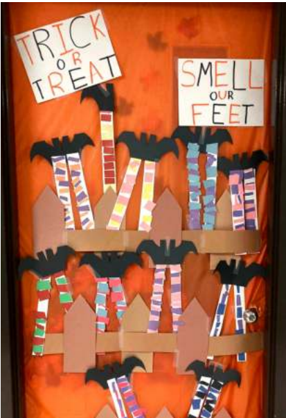
Eardley's doors are ready