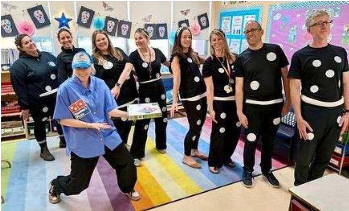
Brilliant staff domino effect at GG