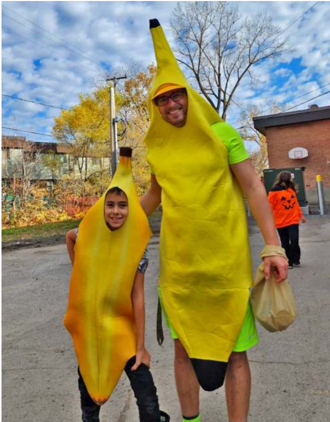
Cute set of bananas at PETES