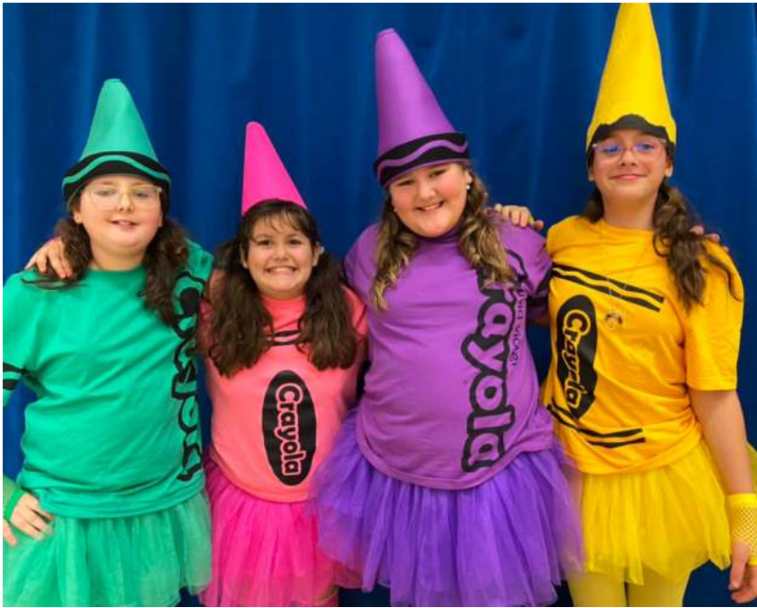
Box of crayons found at GTS's Halloween dance