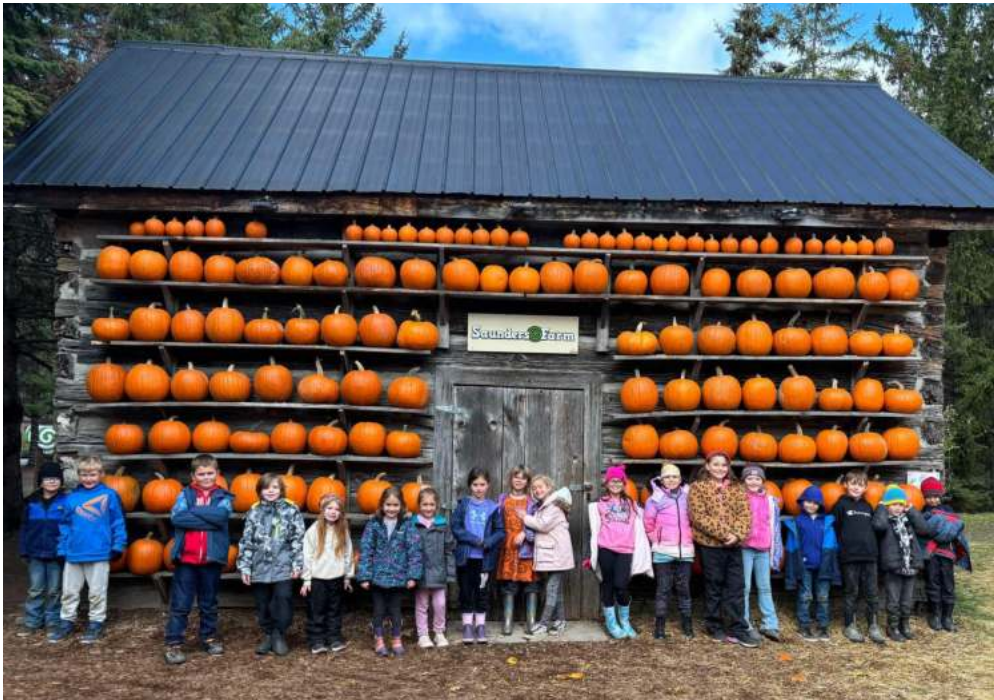
Everyone at St. John's Elementary School visited Saunders Farm!