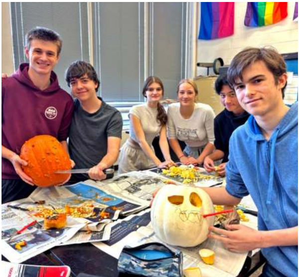
PHS students create explosive pumpkins