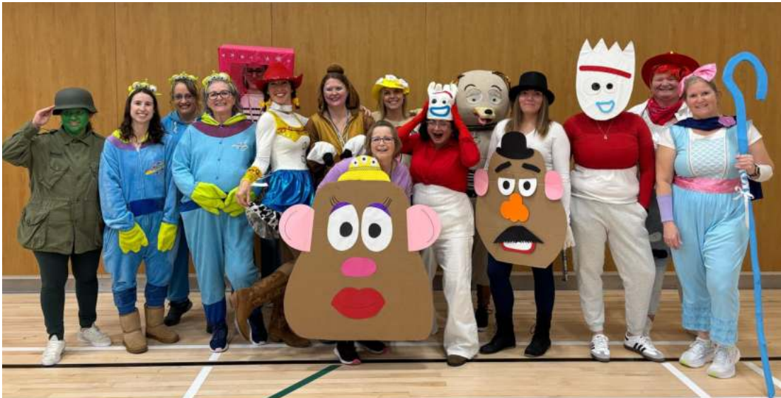
GVS staff got the assignment!