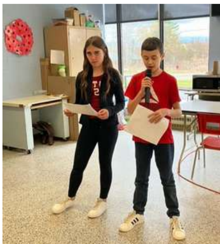
St. John School