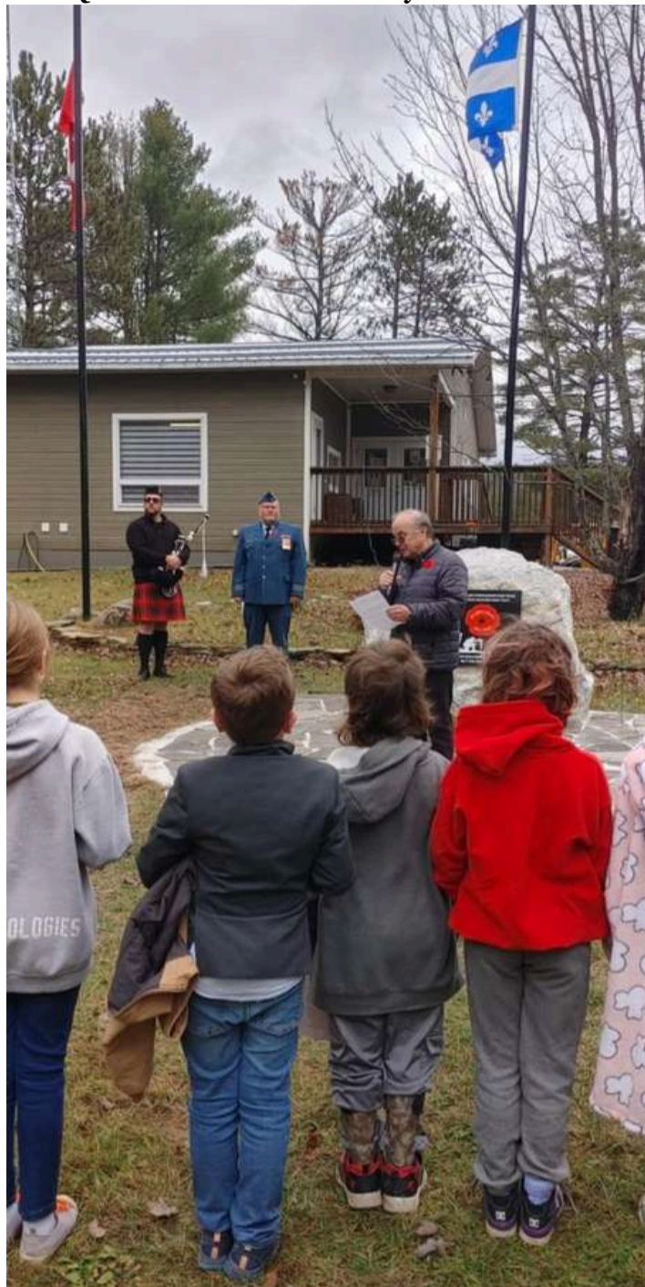
Queen Elizabeth School