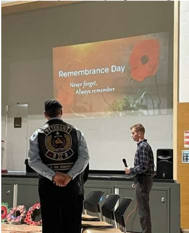
Golden Valley School