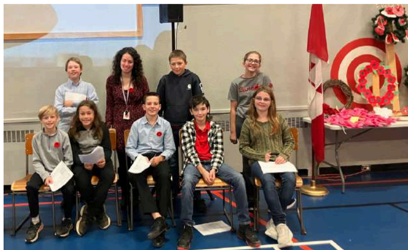
McDowell Elementary School