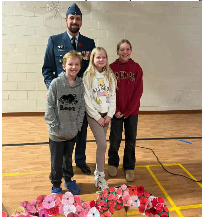
Wakefield Elementary School